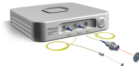
Figure 1: The real-time displacement FPS3010 sensor equipped with 3 channels using single mode fibers and compact sensor units.

In the controller, the signal is split into a low pass filtered direct signal and a 90^\circ phase shifted demodulated signal, enabling quadrature detection for the amount of movement and its direction. These signals are visualized by an application running on standard PCs and IPads, yet can also be routed through real time AquadB and high-speed serial outputs (HSSL), enabling higher OEM integration. For the measurement of the membrane's frequency response, a swept sine wave signal was applied to the membrane covering the full frequency range of 10 Hz to 20 kHz and the displacement was recorded in a sampling frequency of 44.1 kHz. The maximum displacement amplitude of the membrane was about 10\text{ }\mu\text{m} in the resonance peaks (at roughly 550 and 700 Hz). By Fourier-transforming the resulting time- dependent signal, one obtains the normalized frequency response as shown in Figure 3. A double peak structure can be seen that may arise from a beating effect of two resonances in the system, as well as a drop in amplitude at about 1500 Hz.