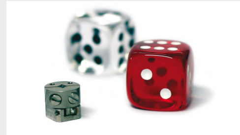
Fig. 1: Ultra compact attocube rotator ANR30/LT with 10 mm diameter and 9 mm height.