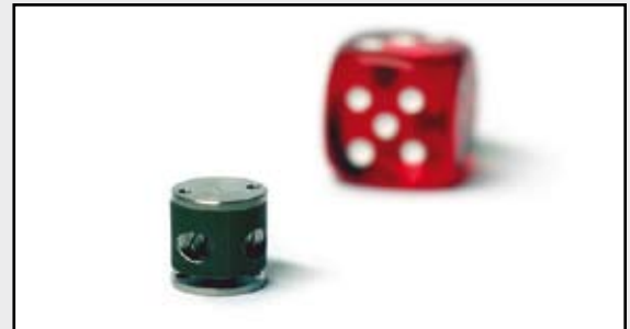
Fig. 1: Photo of the ANPz30, the smallest positioner offered by attocube systems providing high resolution z-positioning over 2 mm.