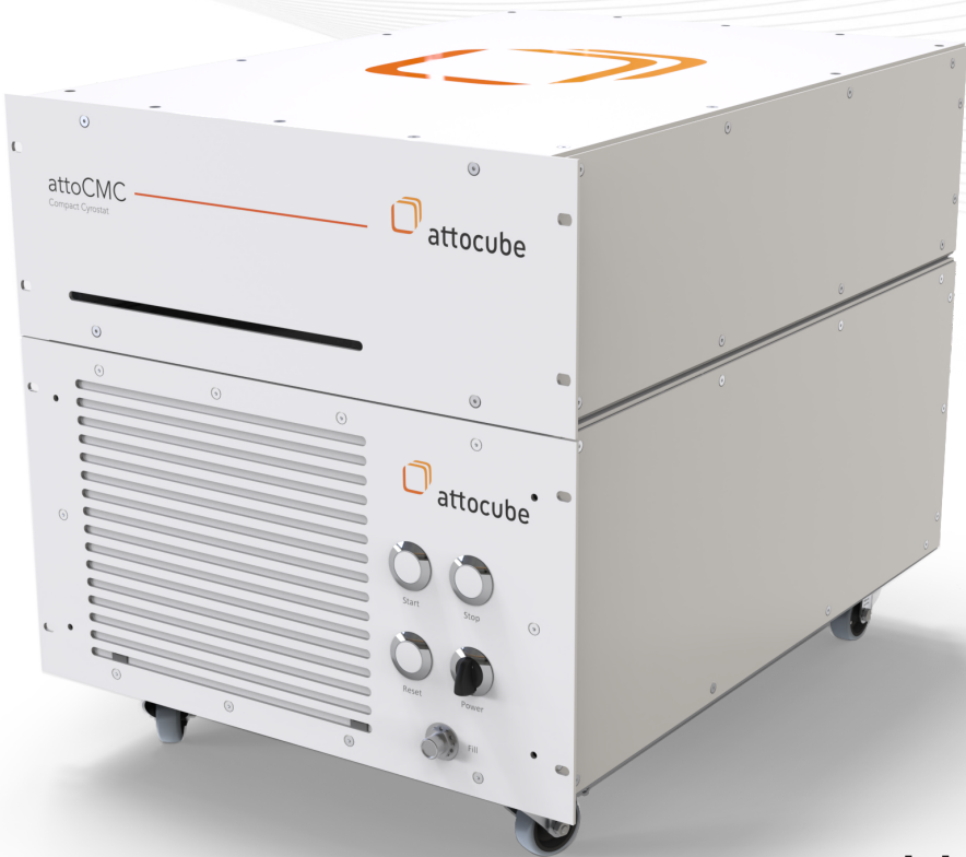
attoCMC compact, rack mountable cryostat system